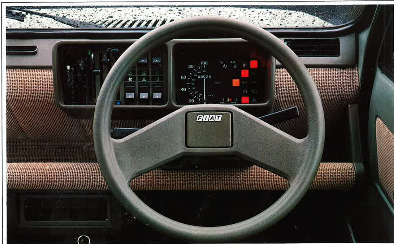
Comprehensive and concise. The dashboard displays speed, fuel level, the engine's water temperature, and a warning light console to report on the cars vital functions, including a light to show when 4 wheel drive is engaged.

In normal driving conditions the Panda shows lively performance in two wheel drive, nipping in and out of traffic or on the open road. And when the going gets rough, just engage the 4-wheel drive mechanism and the 4x4 really comes into its own –