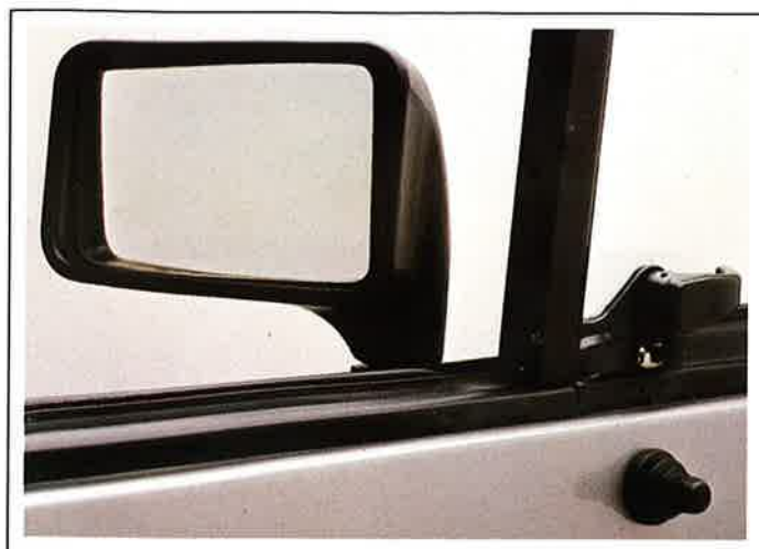
Internally adjustable door mirrors for improved visibility.