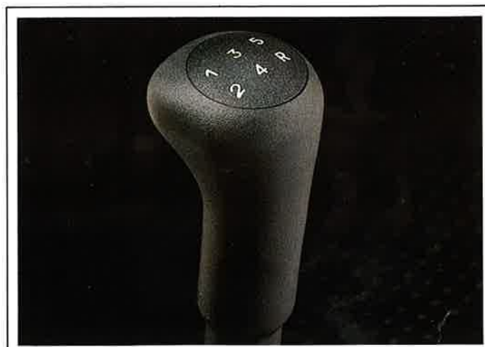
5 speed gearbox, with a crawler 1st gear to cope with sticky conditions and climbing steep inclines.