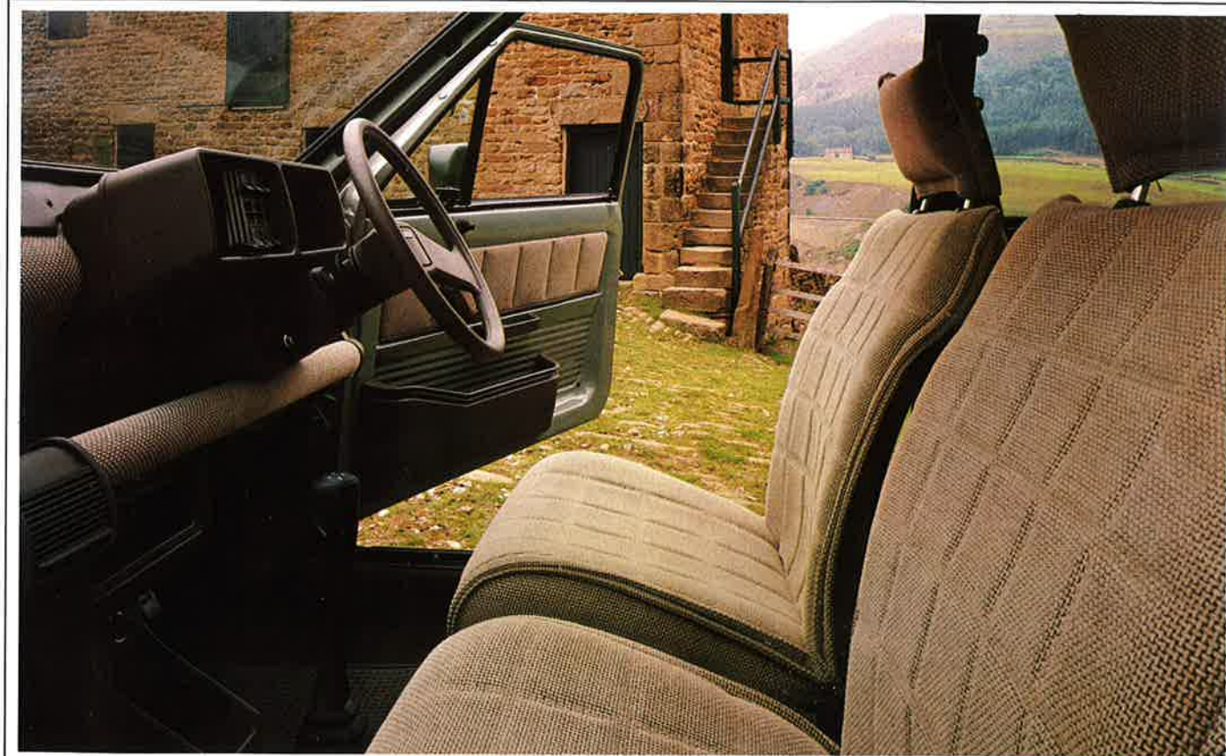
A stylish interior, with smart corded cloth seats which comfortably accommodate five adults. Both front seats recline and head restraints are standard.